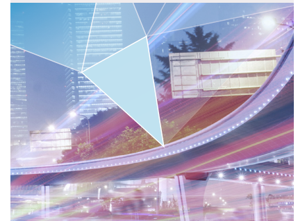
A PIVOT TECHNOLOGY SERVICES OFFERING © 2016 Pivot Technology Solutions. All trademarks or registered trademarks are the property of their respective owners. REF # PTS0116