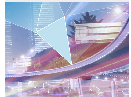
A PIVOT TECHNOLOGY SERVICES OFFERING © 2016 Pivot Technology Solutions. All trademarks or registered trademarks are the property of their respective owners. REF # PTS0116